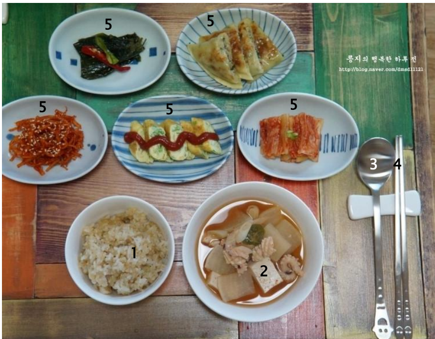
Typical Korean meal